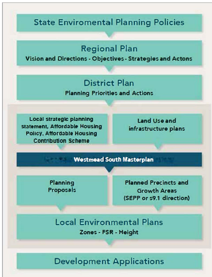
Figure 1: Context of the Affordable Housing Contribution Scheme